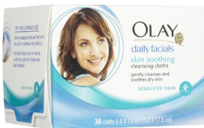
Photo 1. Oil of Olay Daily Cleansing Cloths

The result? A more solid and structurally supported thumbnail repair job just in time for the engagement, and that allows me to continue with my daily practice sessions. While this technique worked in a pinch, you must still be careful with how you use your right hand/thumb until the nail grows back.